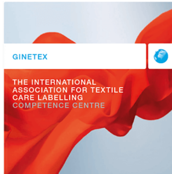
How to join GINETEX as Global Reproducer